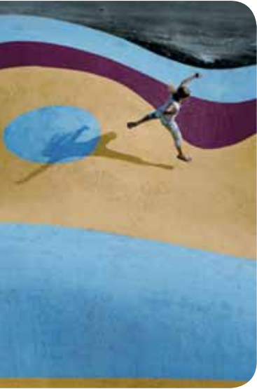
Hellerup Skole, Copenhagen, Denmark Arkitema, Architects