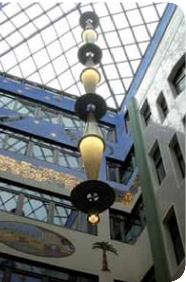
Shopping Arcade Renovation, Leipzig, Germany

Sustainable architectural design integrates consideration of resource conservation and energy efficiency, healthy buildings and materials, ecologically and socially sensitive land-use, protection and enhancement of biodiversity and an aesthetic sensitivity that inspires, affirms, and ennobles. Sustainable architectural design significantly reduces adverse human impacts on the natural environment while improving quality of life and economic well-being.