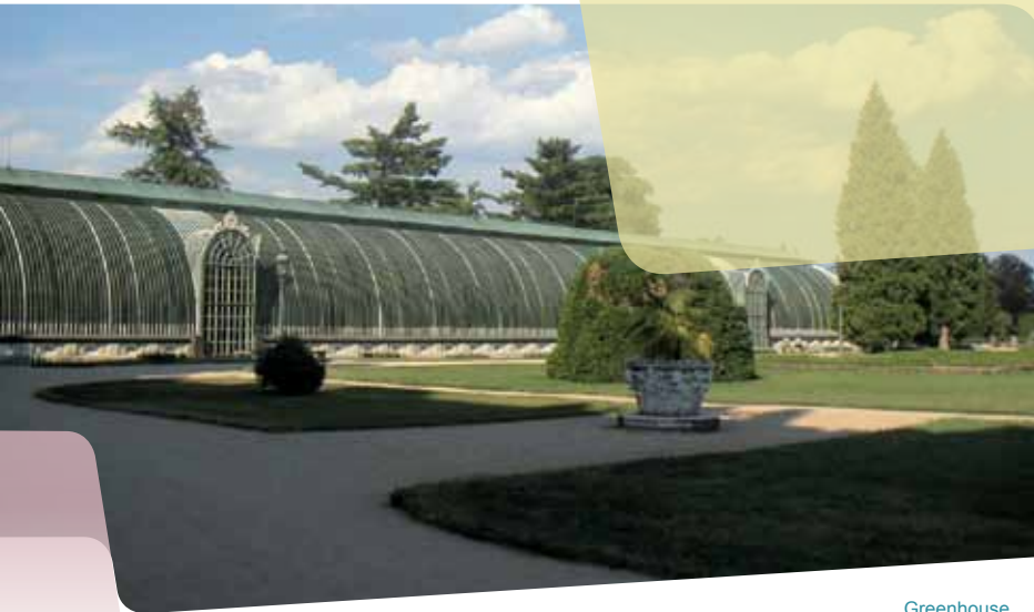
Greenhouse, Czech Republic P H Devignes, Architect

The building industry has a key role to play in any agenda for sustainable development for the 21 st century. The built environment represents a substantial and relatively stable environmental resource. Most buildings survive for several decades, and very many survive for centuries. As the community's principal physical asset, getting good value requires that the building's full life cycle be considered, avoiding short-sighted attempts to merely minimise initial cost. A strategy on sustainable development will seek to prolong the life of existing structures, and indeed to prolong the utilisation of the materials with which they were originally constructed. Adaptation is usually preferable to new building, and upgrading of performance usually represents an efficient deployment of resources.