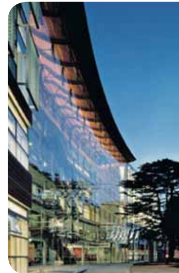
Fingal County Office, Ireland Bucholz McEvoy, Architects

The design and construction of a building which takes optimal advantage of its environment need not impose any significant additional capital cost, and although it may require somewhat increased resources to design compared to more highly-engineered 'conventional' buildings it should be significantly cheaper to operate.