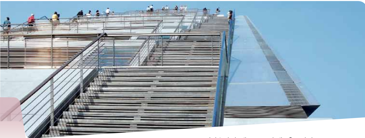
Dockland Office Building, Hamburg, Germany Bothe Richter Teherani, Architect

Following these propositions, the European Union committed itself, in March 2008, to cut greenhouse gas emissions by at least 20% by 2020, in particular through energy efficiency