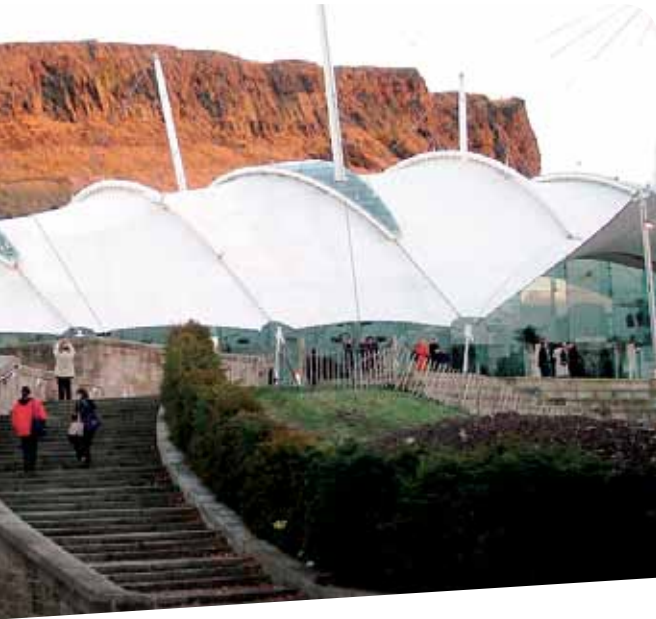
"Our Dynamic Earth" Building, Edinburgh, Scotland Michael Hopkins & Partners, Architects

international agreement on energy efficiency. Since the adoption of these binding targets, progress has been made by the re-casting or revision of several key EU Directives on the energy performance of buildings, on the eco-labelling of energy-related products and on the eco-design of energy using products. Furthermore, the European Economic Recovery Plan, adopted in December 2008, foresees substantial investment in the construction sector and specifically in the energy efficiency upgrading of existing buildings. In this context all the actors from the construction sector have come together to establish, with the European Commission, a European Initiative in the form of a Public-Private Partnership that will steer investment in research and development in the field of energy efficiency of buildings.