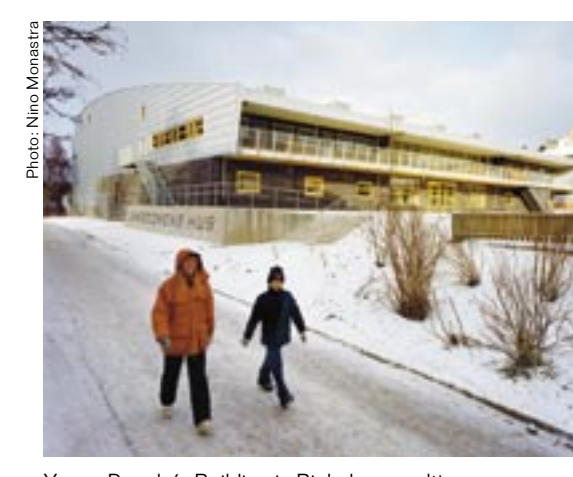
Young People's Building in Rinkeby, a multicultural suburb to Stockholm, Sweden. Architects: Anders Bergcrantz, Bergcrantz Arkitekter AB. Nominated to the Kasper Salin prize 1999.

European architectural policies must bridge the gaps that arise between existing perceptions of the built environment and the reality of present day structures. In an enlarged Europe, the need for common guidelines for the quality of the built environment will further increase. From the metropolitan conurbations around large cities such as Paris, London, Milan or Warsaw to the thinly populated countryside on its periphery, the European Union must deal with an enormous range of questions in relation to spatial development