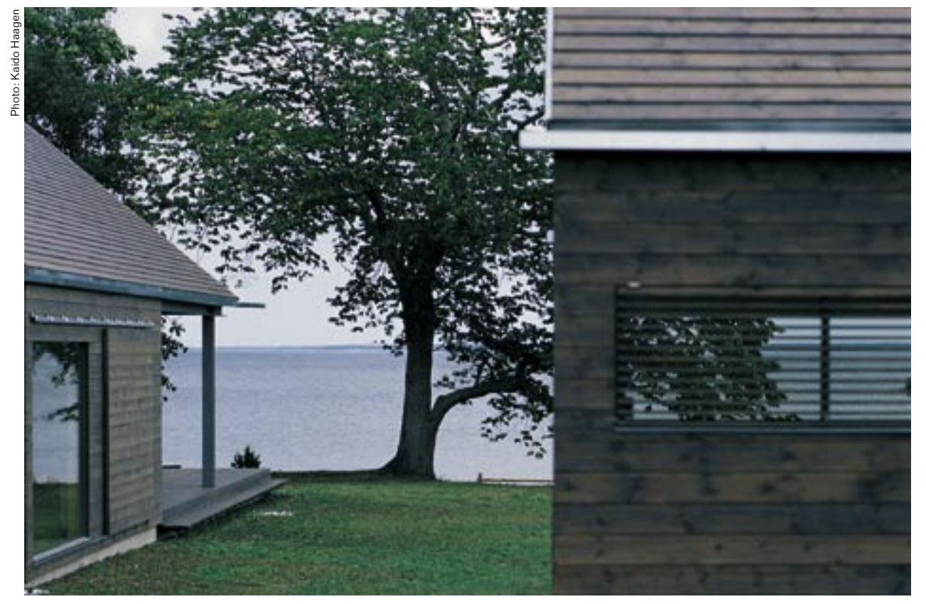
Mardi Farm, Saaremaa Island, Estonia. Architect: Juri Okas. Award won: Estonian Cultural Endowment, architectural endowment award for the best building 2002.

The European Union took account of these developments in a Council Resolution on architectural quality in the urban and rural environments<sup>2</sup>, thus adopting a common position on the design of the built environment for the first time. Notably, this resolution calls on the Commission to "ensure that architectural quality and the specific nature of architectural services are taken into consideration in all its policies, measures and programmes." As early as 2000, the "European Forum for Architectural Policies" was founded as a platform for architectural policies. It acts as a networking organisation for European governments, professional organisations and cultural institutes. Both developments are important steps towards a European Architectural Policy, and their potential must be harnessed and further developed.