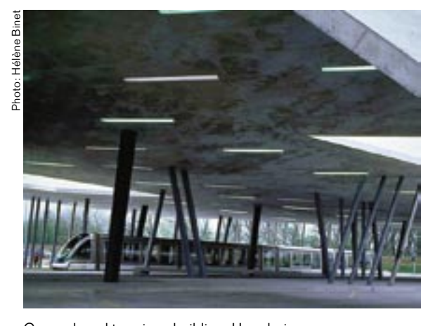
Car park and terminus building, Hoenheim Nord, Strasbourg, France. Architect: Zaha Hadid, Award won: European Union Prize for Contemporary Architecture - Mies van der Rohe Award 2003.

The European Court of Justice has ruled, in a case from 1999, that the liberal professions: "...are of a marked intellectual character, require a high-level qualification and are usually subject to clear and strict professional regulation. In the exercise of such an activity, the