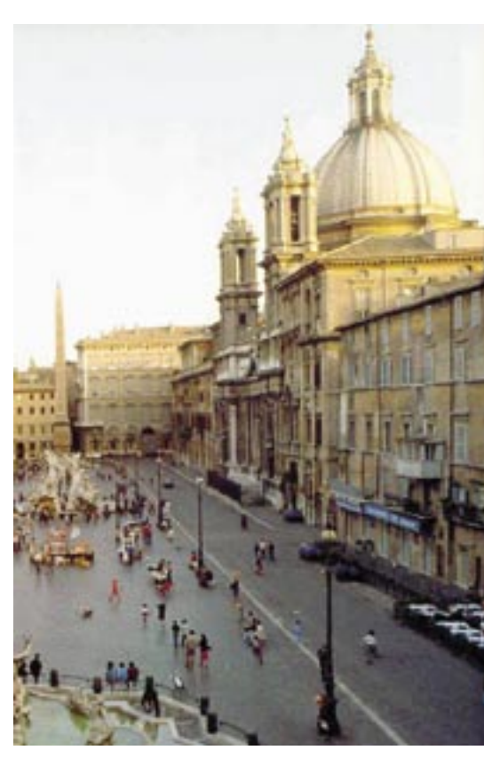
Piazza Navona, Rome, Italy

5. IT IS NECESSARY to ensure that future EU programmes for research are properly formulated so as to include issues of importance such as quality of life, urban environment, built heritage, existing buildings and innovative approaches to construction - in short, architecture. Furthermore, the ACE calls on the European Commission to ensure that it adequately takes into account the results of such research in all of its policy proposals that affect the living environment.