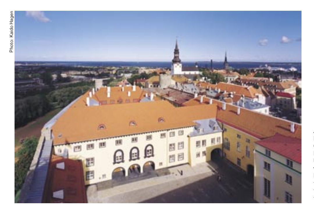
Assembly Hall of the Estonian Parliament (restored), Tallinn, Estonia. Architect: Ular Saar, 1997, Award won: Estonian Cultural Endowment, architectural endowment award for restoration of historic interior

Clearly everything possible must be done that can help to achieve and implement these policies whilst adopting holistic approaches. The specific recommendations contained in the following chapters are intended to make a positive contribution to this process.