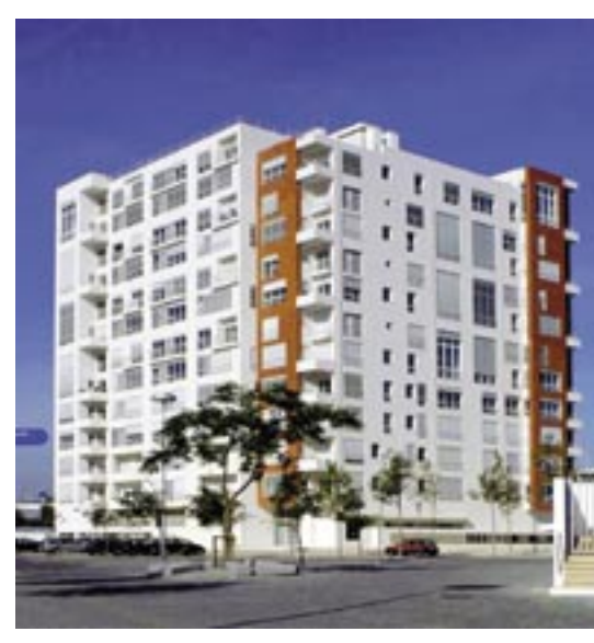
Residential bioclimatic building, Torre Sul, Lisbon, Portugal. Architects: Tirone Nunes Lda,

It is during the design phase that significant influence can be brought to bear on the LCC and the LCA aspects of a project. After the event, defects can either not be corrected at all, or only at considerable additional expense. In the interest of building owners and users, the promotion and enforcement of LCC and LCA is therefore an important task for the coming years.