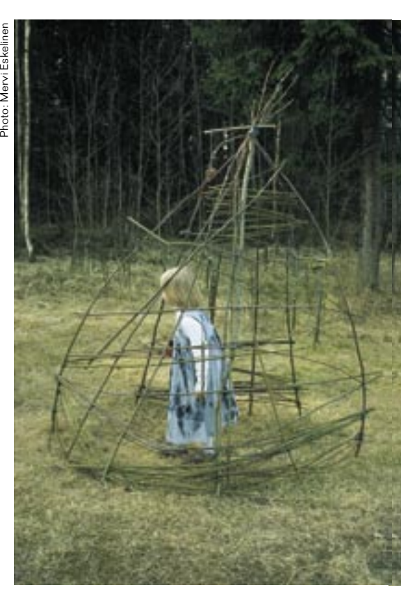
A spot on a listening trail, Lastu architecture and environmental culture school, Finland.

4. AS SOCIETY AT LARGE, and citizens in particular, are both the clients and users of the results of architectural services, it is imperative that public policies, at all levels, should strive to create an ethos within society that values quality in buildings and in public spaces. Moreover, it is important that awareness and the capacity to understand architectural values should be instilled as early as possible in the educational process, starting in kindergarten and continuing throughout all stages of formal education.